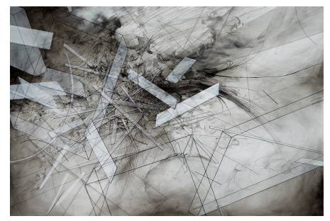
Nocturne (Dispersion No 21), 2017 Ink & acrylic on canvas, 40 x 60 in Chee-Keong Kung