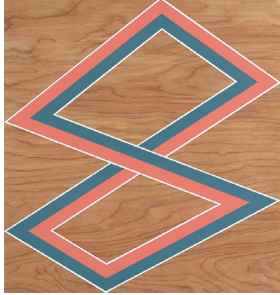
Subspace_256, 2017 Acrylic on birch plywood, 14.5 x 13.5 in J.T. Kirkland