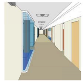
3 LEVEL G2 CORRIDOR VIEW BY LECTURE HALL