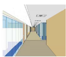
2 LEVEL G2 CORRIDOR VIEW BY ELEVATOR