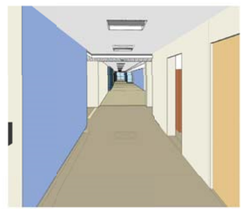
5 LEVEL G1 CORRIDOR VIEW BY LECTURE HALL