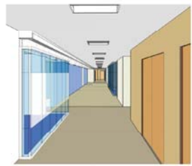
4 LEVEL G1 CORRIDOR VIEW BY ELEVATOR